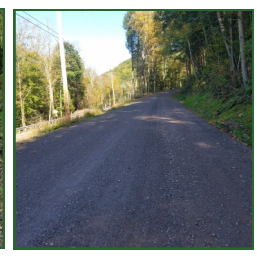
Homes Hollow Penn Township