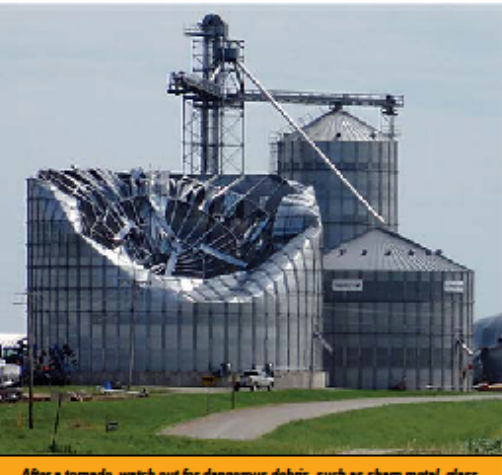
After a tomado, watch out for dangerous debris, such as sharp metal, glass, or downed power lines.

A severe thunderstorm has been indicated by radar or reported by a spotter producing hail one inch or larger in diameter and/or winds exceeding 58 mph. Warnings indicate imminent danger to life and property. Take shelter in a substantial building. Severe thunderstorms can produce tornadoes with little or no advance warning.