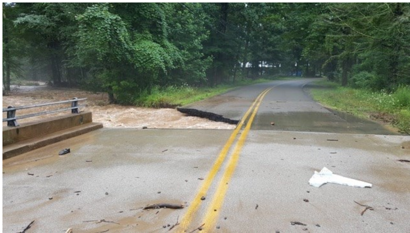
Bridge at Big Bear, Lower Barbours Rd.

bridges and mostly to the eastern part the county. Each storm seemed to come just short of catastrophic flooding. We were at a point where even a heavy thunderstorm would be enough to cause flooding in some areas. Many municipalities were repairing the same roads multiple times. The greatest amount of damages were sustained from July 21-27, 2018 & August 10-14,