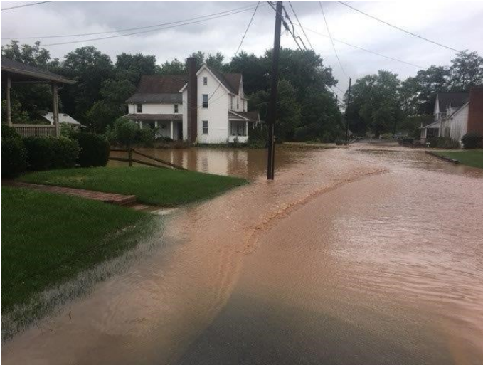
Pond Road, Muncy Township

damage threshold to request federal funding. Lycoming County has far exceeded the threshold amount to obtain Public Assistance for the damages reported for the July 21-27 & August 10-14 storms. Dates are being set up for FEMA team members to conduct eligibility inspection tours of heavily affected roads and infrastructure.