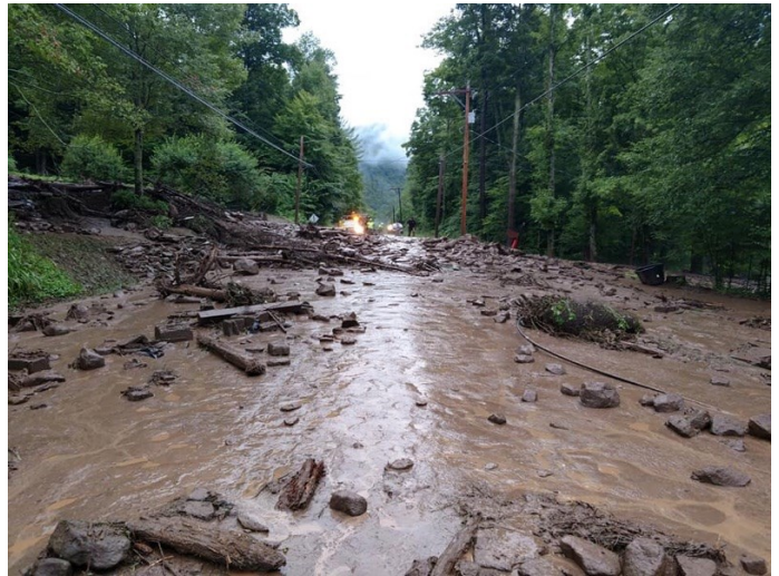
Route 87, Barbours

Starting on July 21, 2018 Lycoming County experienced some very wet weather. Lycoming County experienced three separate rain events that brought flooding and mudslides to parts of our area. It seems to have become common but the rain was concentrated to localized areas rather than a countywide event like a tropical storm. Fortunately most of the damages were limited to roads and