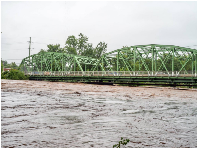
Green Bridge, Montoursville