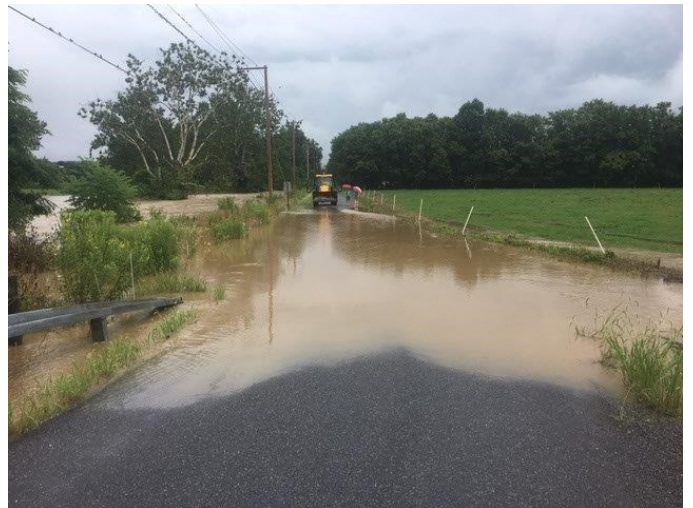
Narber Fry Road, Muncy Twp.