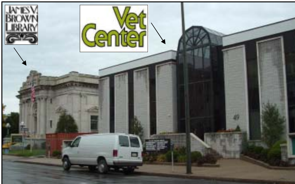
New location of the Vet Center: Suite 104, 49 East Fourth Street, Williamsport—next to the James V. Brown Library (on left).