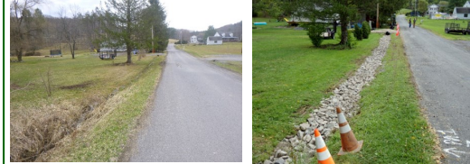
Before Schoolhouse Road, Hepburn Twp.

In 2022, the Dirt, Gravel & Low-Volume Roads Program provided funding for 10 projects totaling $530,673.01. Approximately 6.4 miles of dirt and gravel roads were repaired.