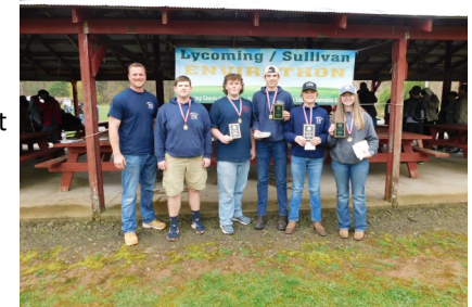
Lycoming Sullivan Envirothon Top Overall Team Montoursville Team D