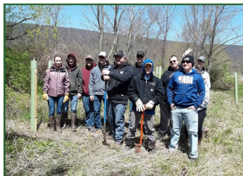
Montgomery H.S. Environmental Science Class—K10 Planting Project