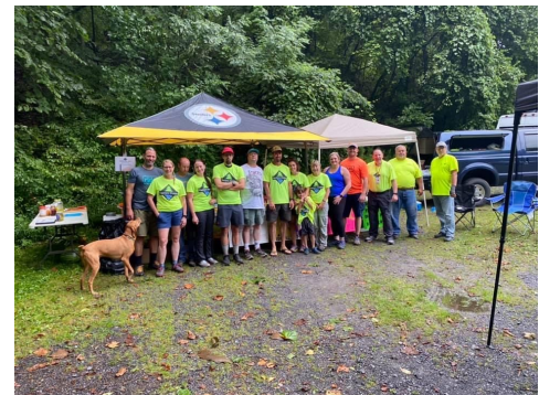
AS-4 Browns Run Crew