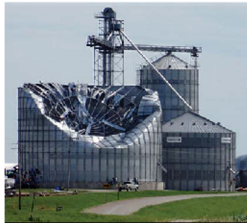
After a tornado, watch out for dangerous debris, such as sharp metal, glass, or downed power lines..

A severe thunderstorm has been indicated by radar or reported by a spotter producing hail one inch or larger in diameter and/or winds exceeding 58 mph. Warnings indicate imminent danger to life and property. Take shelter in a substantial building. Severe thunderstorms can produce tornadoes with little or no advance warning.